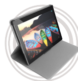
Folio Case + Film